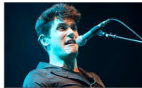
A Chastened John Mayer at the Toyota Center