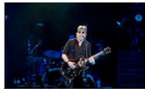
George Thorogood with Moreland & Arbuckle at the House of Blues