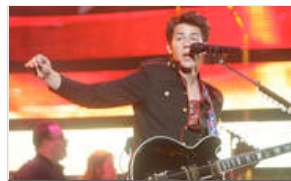
The Jonas Brothers, Past Their Prime, at RodeoHouston